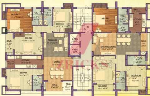
Flat A Area: 2,115 sq. ft